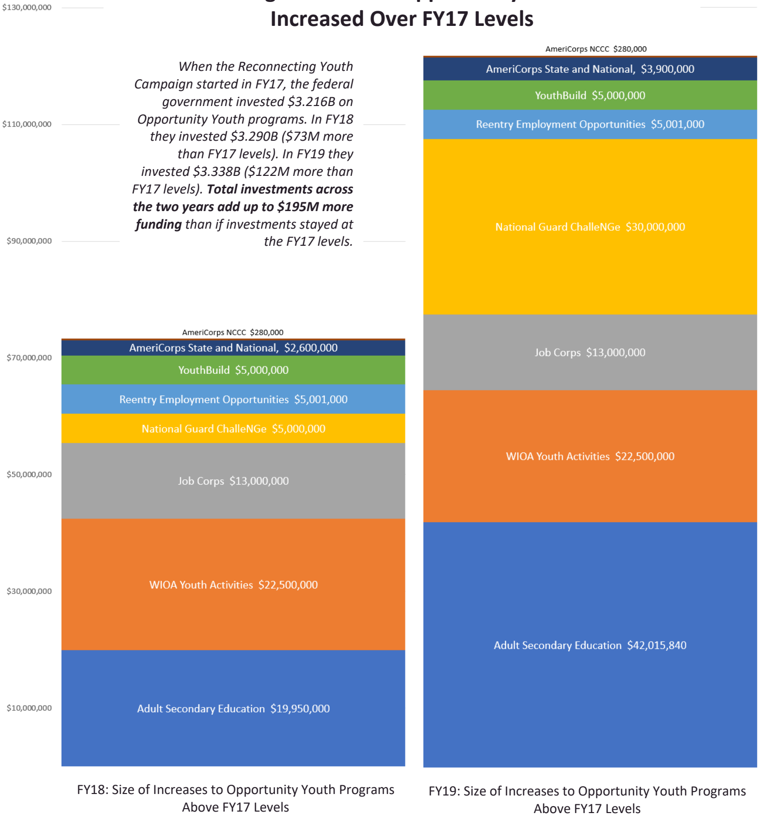
FY18: Size of Increases to Opportunity Youth Programs Above FY17 Levels

When the Reconnecting Youth Campaign started in FY17, the federal government invested $3.216B on Opportunity Youth programs. In FY18 they invested $3.290B ($73M more than FY17 levels). In FY19 they invested $3.338B ($122M more than FY17 levels). Total investments across the two years add up to $195M more funding than if investments stayed at the FY17 levels.