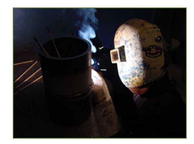
Welding Technology www.pcc.edu/programs/welding

Welding is a skill used by many trades: sheet metal workers, iron workers, diesel mechanics, boilermakers, carpenters, marine builders, steamfitters, glaziers, repair & maintenance personnel in applications ranging from the home hobbyist to heavy fabrication of bridges and ships. Welders work for shipyards, repair shops, manufacturers, contractors, and government. PCC teaches a variety of welding techniques.